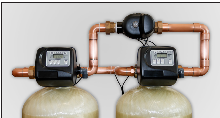
EXAMPLE OF A TWIN CONFIGURATION