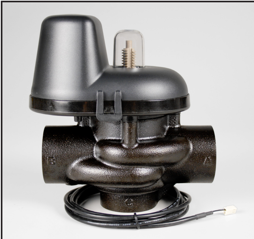
Order No. V3071 • NPT Order No. V3071BSPT • BSPT